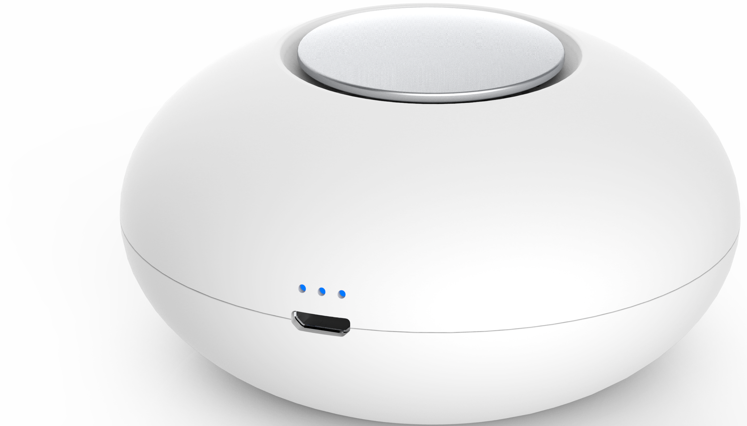
Battery level indicator charging port.