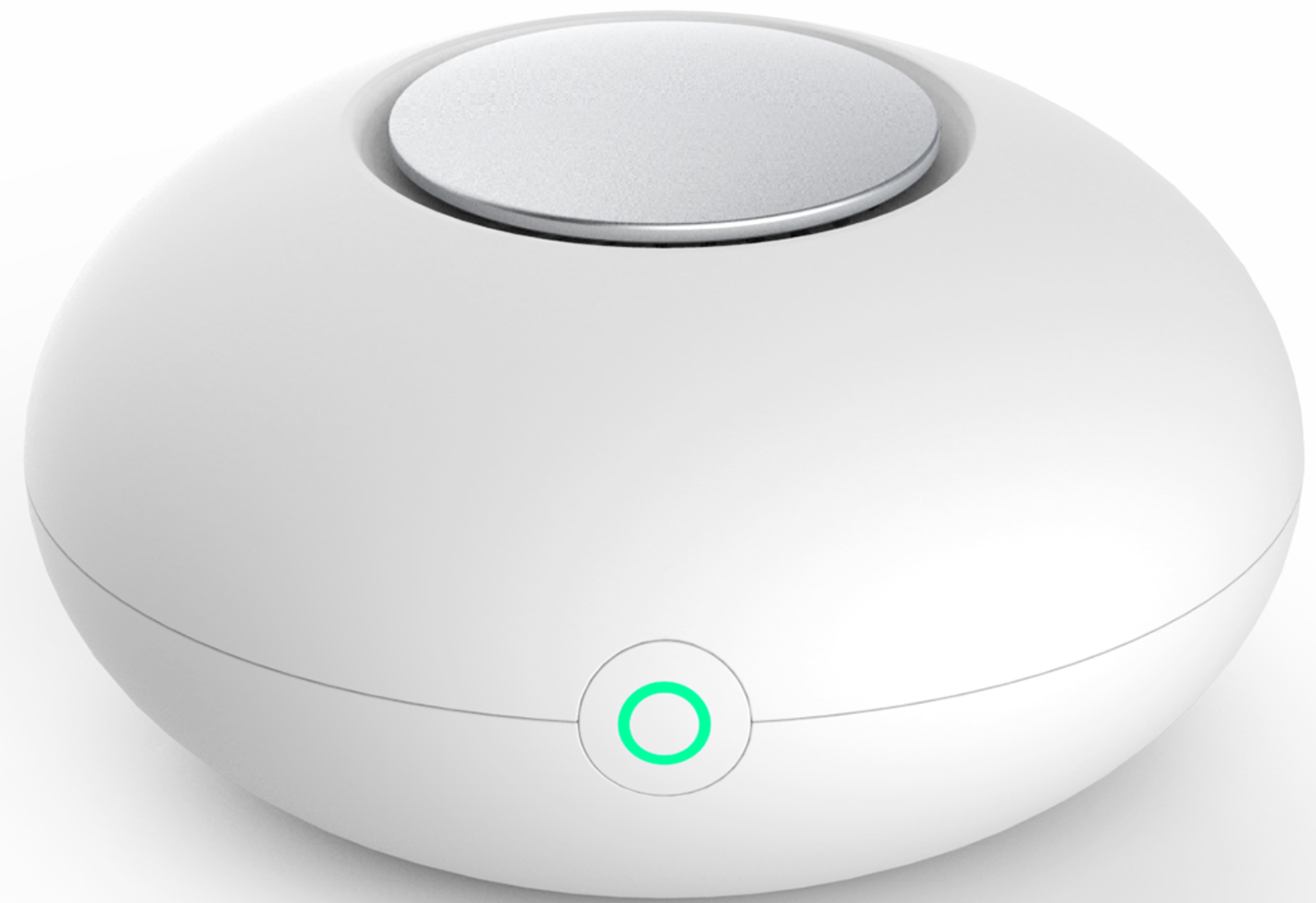
○ 8h timing cycle (10min work, 2min rest)