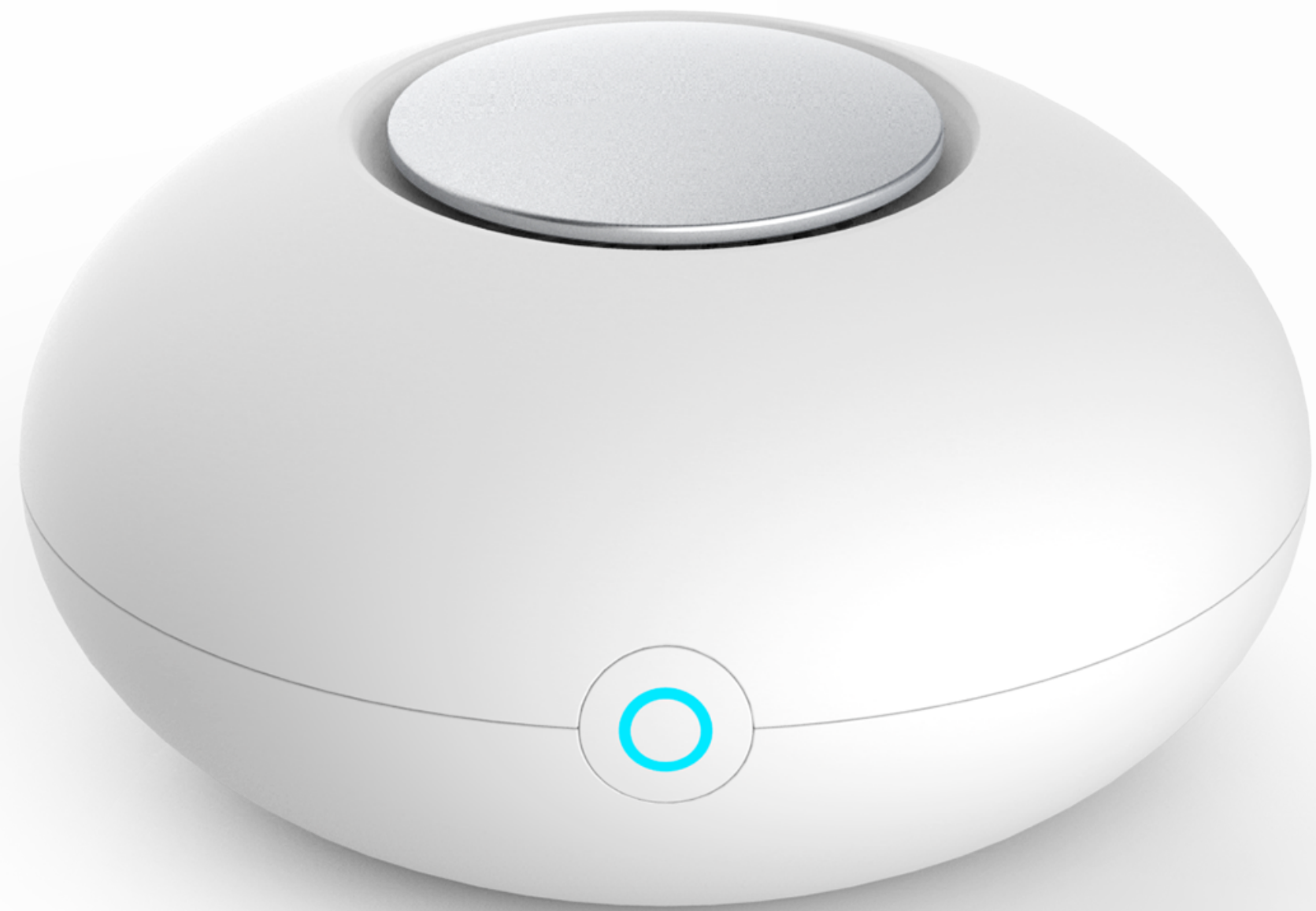
○ 30min continuous work